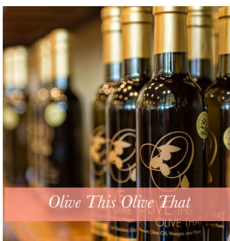
Olive This Olive That