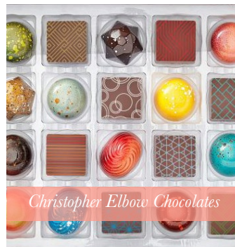
Christopher Elbow Chocolates